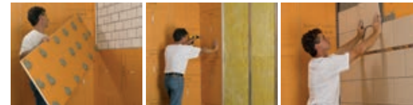
SUBSTRATE, STRUCTURAL PANEL, BONDED WATERPROOFING

For this purpose, Schlüter®-KERDI-BOARD offers the following properties: